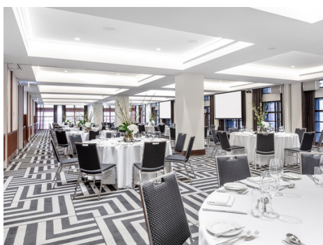
THE HAMMOND ROOM

The Upton caters to parties of up to 10 guests and is equipped with a large format LED TV screen and up-to-date technology, making it ideal for intimate meetings or an event breakout space.